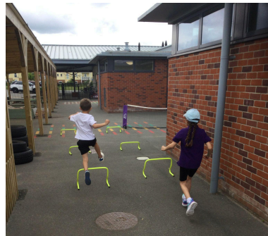
One of the sports activities we have been practising during PE

This year has flown by and the pupils seem to have grown even taller over the half term break! We would like to take this opportunity to express how proud we are of the children, their hard work and the commitment they have shown this, as they get ready to fly into year 2. We have lots of exciting lessons planned for our final half term and we cannot wait to share the children's successes with you as we near the end of the academic year. Thank you for your continued support and helping your child at home too!