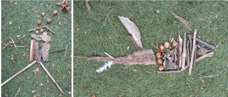
Some of the fantastic nature art the children have made since returning to school!

Welcome back to all of our Year 2 pupils and their families! We hope that you had an enjoyable break over the summer and we look forward to working with you over the coming terms.