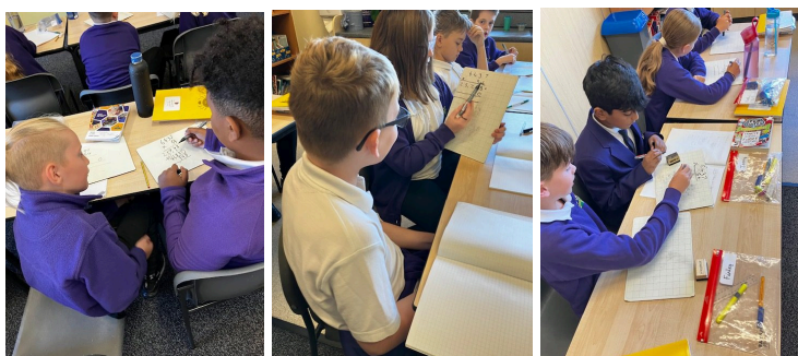
Year 6 have been peer teaching in Maths and recapping multiplication. In pairs, they taught each other how to multiply 4 by 2 digit numbers.