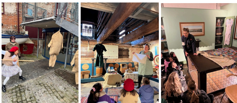
Year 6 enjoyed their visit to the Time and Tide Museum to celebrate their learning on WWII.